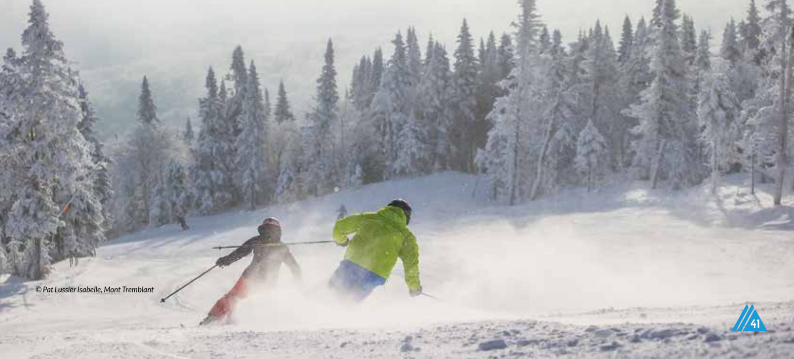
© Pat Lussier Isabelle, Mont Tremblant