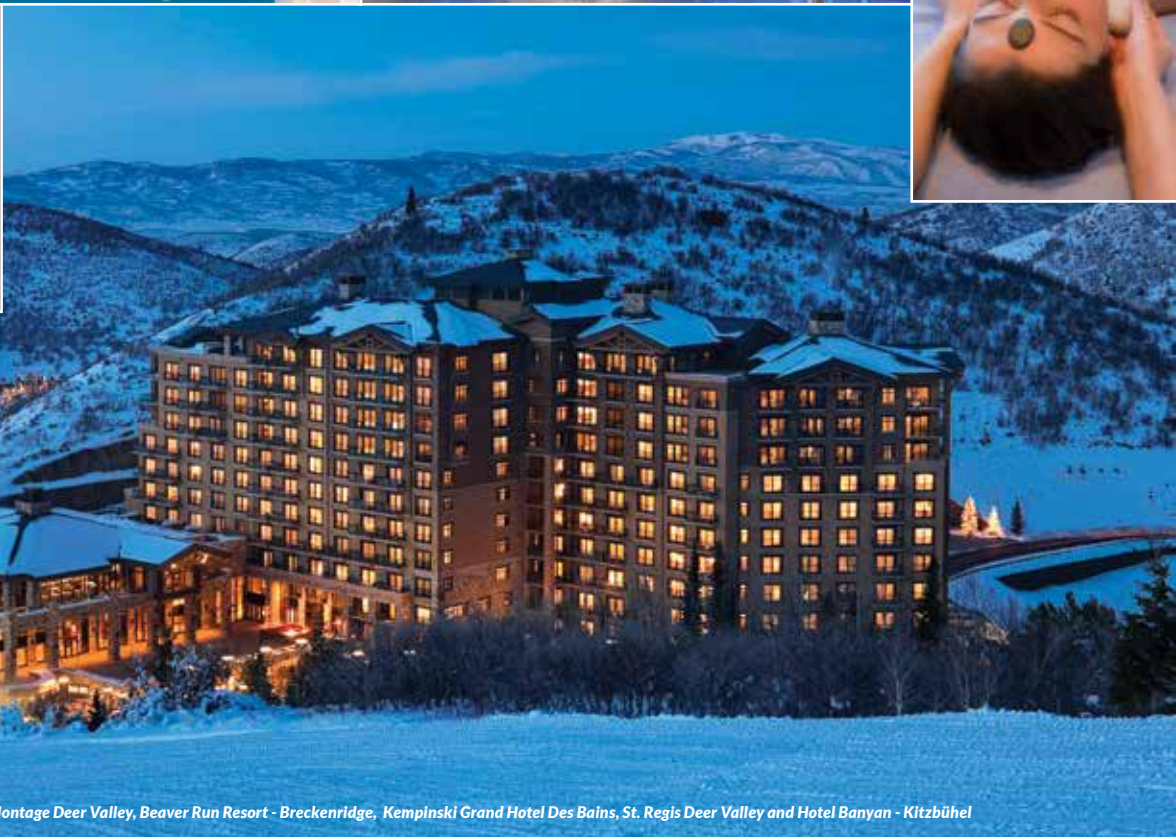
Photos clockwise from top left: Montage Deer Valley, Beaver Run Resort - Breckenridge, Kempinski Grand Hotel Des Bains, St. Regis Deer Valley and Hotel Banyan - Kitzbühel